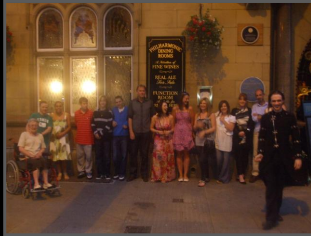
Hope Street Shivers