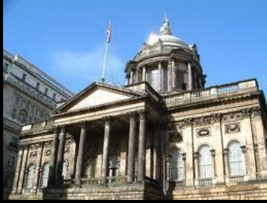
Liverpool Town Hall