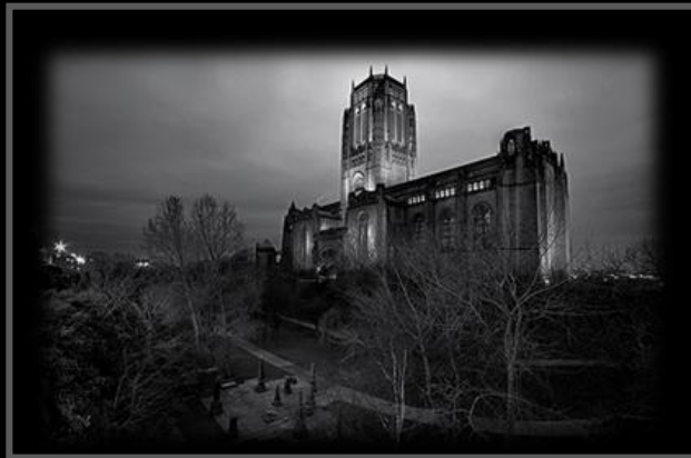
The Anglican Cathedral