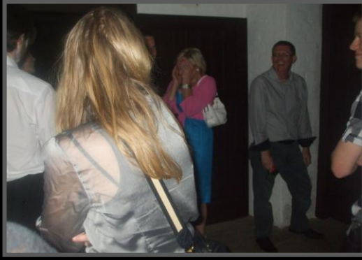
Scary moment in the cells of St George's