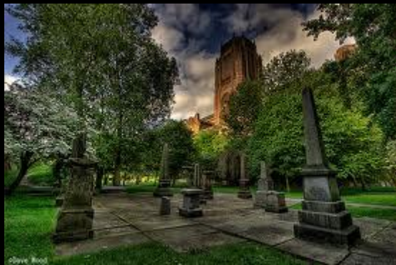
St James Cemetery