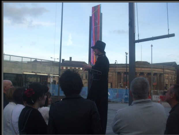
Guide telling tales of old and new