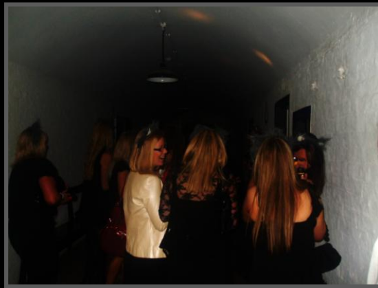
A journey through the dark eerie cells...Beware of what is behind you!