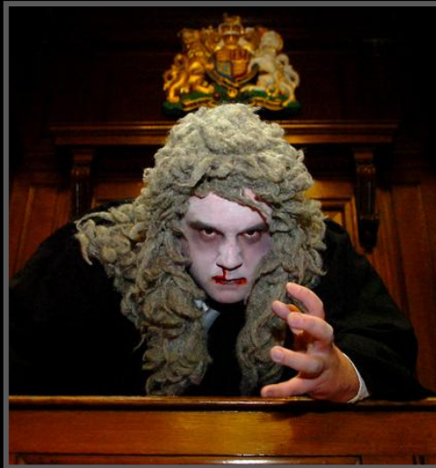
Notorious judge at St George's Hall