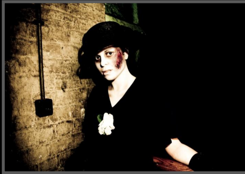
Actor at St George's Hall