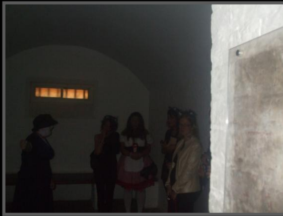
Unexpected visitor from the past comes back to tell her tale