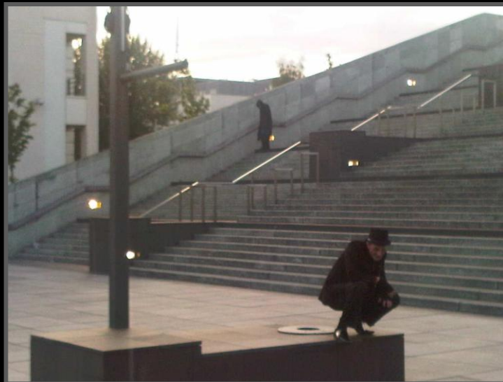
Look behind you!