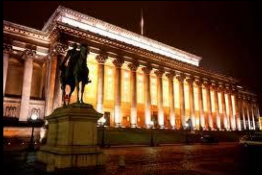
St George's Hall