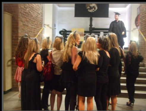
Hen Party await their fate at St George's Hall